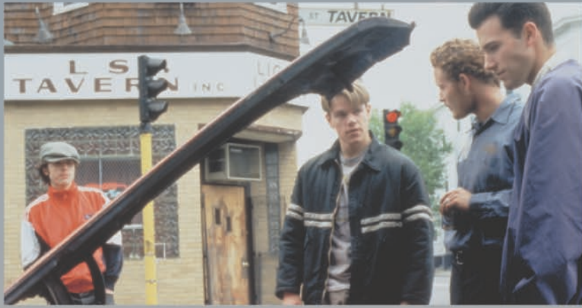
Casey Affleck, Matt Damon, Cole Hauser and Ben Affleck in front of the L Street Tavern during the filming of the 1996 film Good Will Hunting .