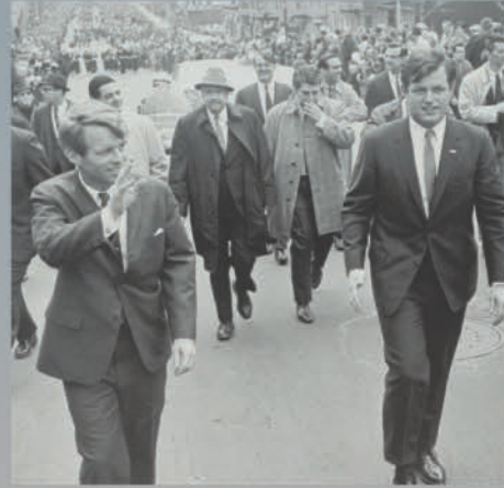
Bobby and Teddy Kennedy on East Broadway during the 1966 Saint Patrick's Day Parade.

South Boston, colloquially known as "Southie", is one of the oldest neighborhoods in the United States. Historically, the neighborhood has been home to the majority of Boston's Irish-Catholic population. While it has grown into a mecca for young professionals over the past 20 years, South Boston still retains its character and tradition. The neighborhood's Fort Point and Seaport Districts have also undergone their own evolution where large areas of surface parking and undeveloped land have been transformed into millions of square feet of Class A office towers, restaurants and luxury housing.